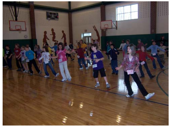
Students practicing one of the many steps