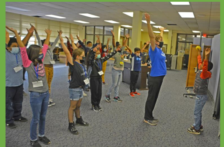
Millbrook Elementary

On behalf of the Board, Staff, and children we serve, thank you for your support. NC AIA believes that participation in the arts promotes self-confidence, builds self-esteem, self-discipline, tenacity and a commitment to excellence. Please donate today by check or online!