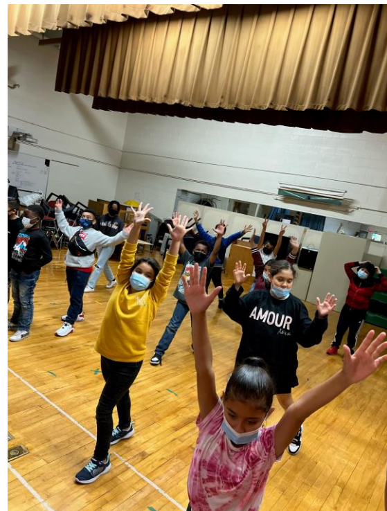
York Elementary School

Mark your calendars now for NC Arts in Action's annual Gala event to be held April 30 at the North Carolina Museum of Art. This celebration will feature great food, cocktails and a silent auction. More details will come this winter so please save the date and plan to attend.