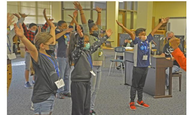
Millbrook Elementary

NC AIA kicked off our new year of programs by offering Summer Learning in 10 Durham schools. With funding from Durham Public Schools, we delivered a two-week intensive learning program for children in fourth grade. Students at each participating school learned about things move, animal adaptations, conservation, and space exploration. Students explored these concepts through dance and music and performed a final showcase at the two-week residency's end.