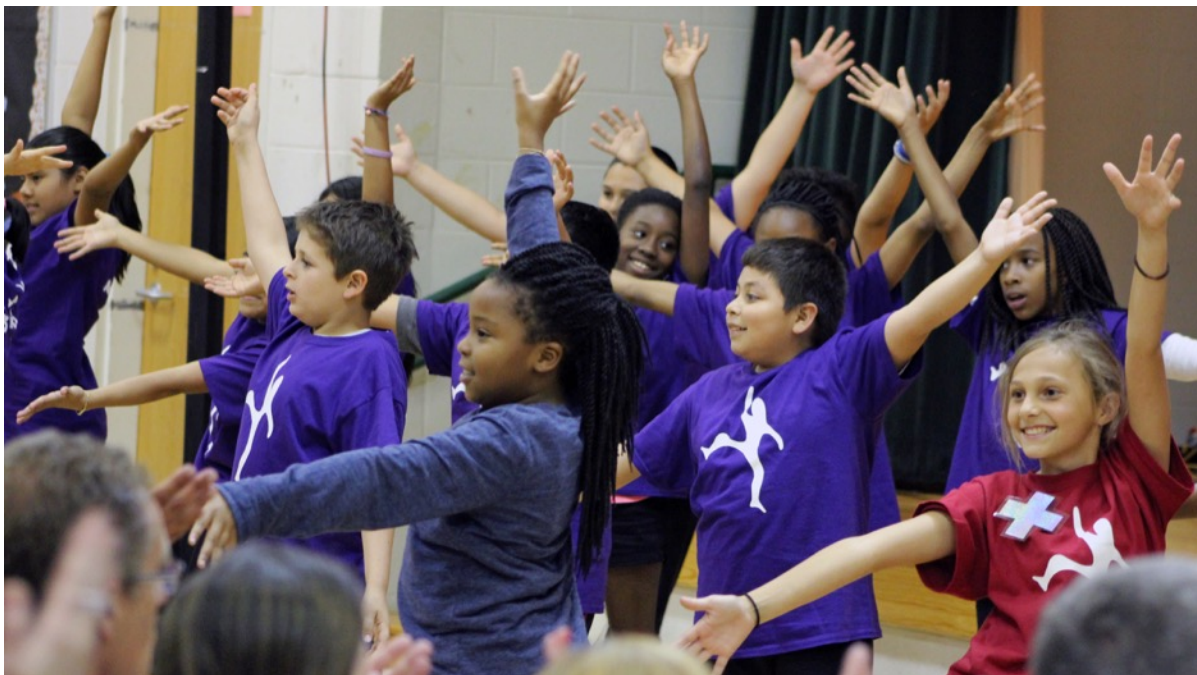
Baileywick Elementary