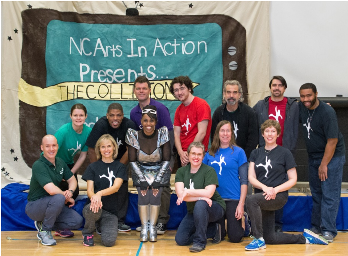
NC AIA Staff