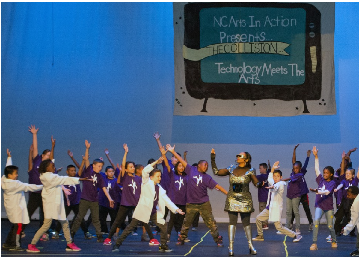
Lake Myra and Knightdale Elementary Schools