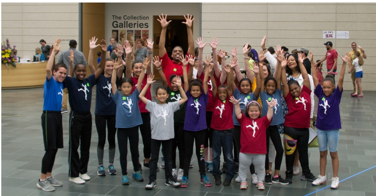
LEAP Team at Nasher

Our Learning Excellence and Perseverance (LEAP) dancers deepened their dance experience by participating in our Saturday program throughout the school year. This tuition-free program for Arts in Action graduates extends the benefit of our core programming to more students. Our 40 LEAP dancers are our ambassadors of the Arts in Action program. They gave showcase performances throughout the community at the Nasher Museum of Art at Duke University, the NC School of Science and Math, Marbles Kids Museum, Knightdale High School and at after-school events.