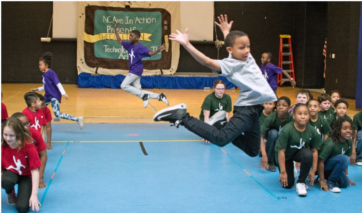
Leaping Dancers at Millbrook Elementary