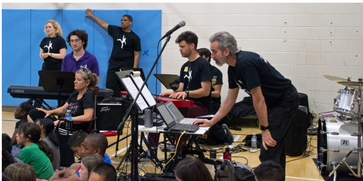
NC AIA band plays live music at every AIA performance and class

“I loved the program. My son is not as shy and is willing to try new things.” – Parent of an Elementary School Student